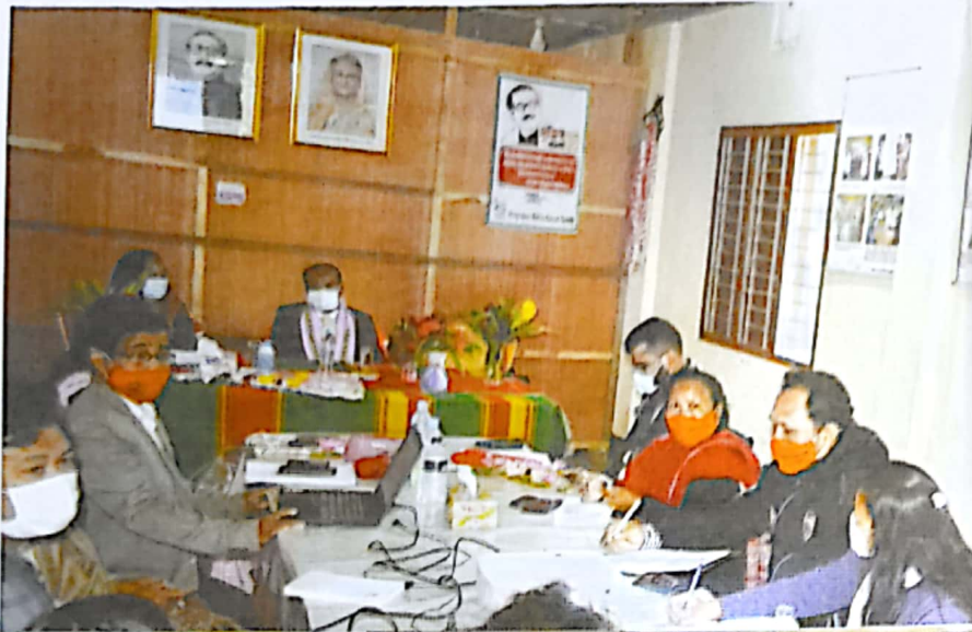
NGO Activities Monitoring visit Honorable Deputy Commissioner of Khagrachhari Mr. Pratap Chandra Biswas on 15 December 2020.