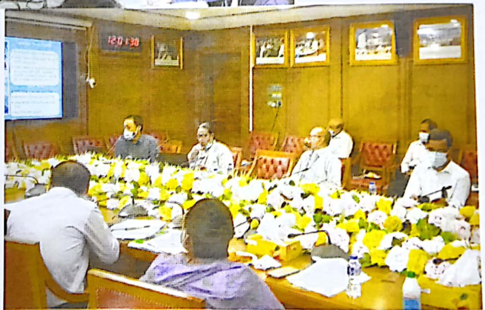
NGO Activities Monitoring Meeting at Ministry of Chittagong Hill Tracts Affairs on 28 August 2020.