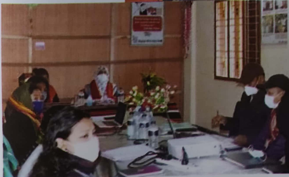
NGO Activities Monitoring visit Upazilla Nirbahi Officer, Khagrachhari Sadar, Khagrachhari Hill District on 29 December 2020.