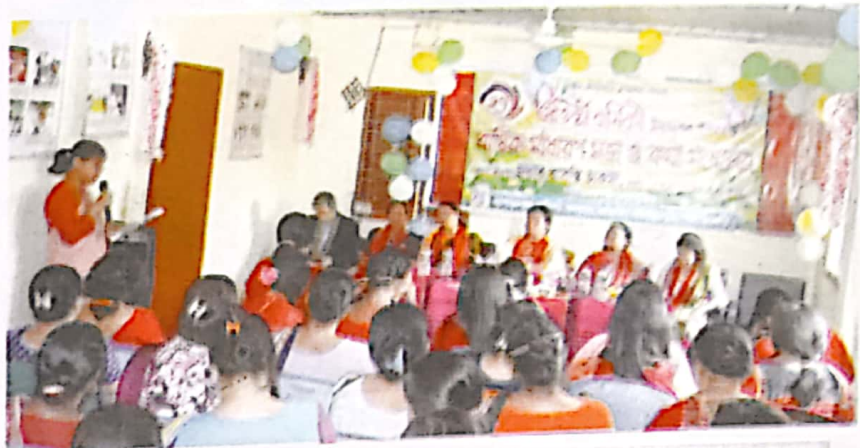
Annual General Meeting of KMKS